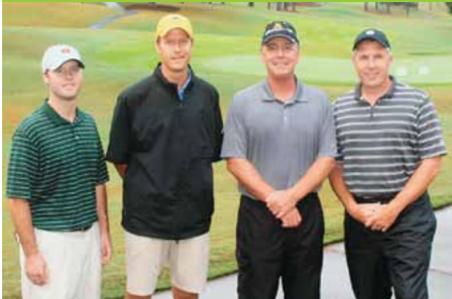
Brasfield & Gorrie LLC