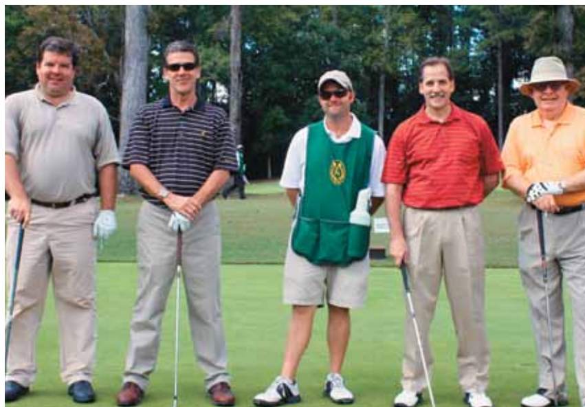
Bendin Sumrall and Ladner LLC