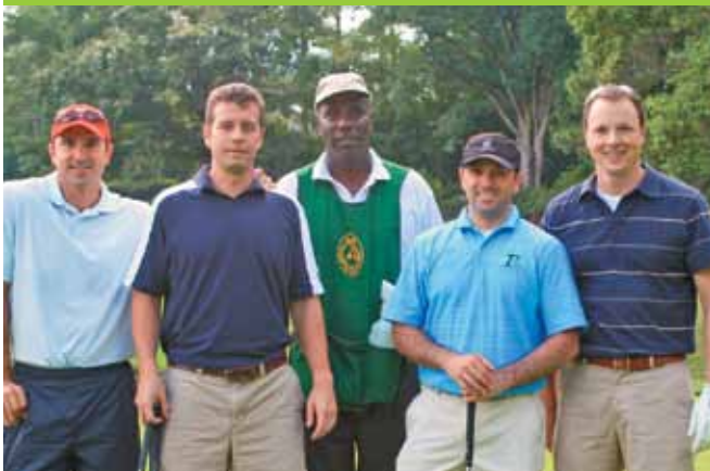
McKenna Long and Aldridge LLP